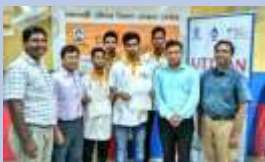
Trained candidates in Plumbing being provided with Placement Letters at Aradhya Vaypaar Pvt Ltd in West Bengal.