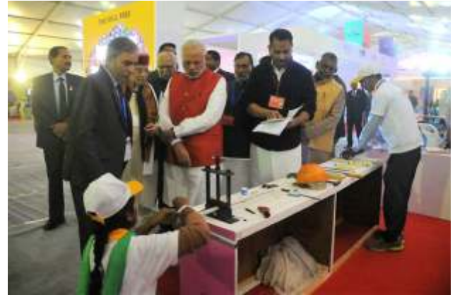
The Hon'ble Prime Minister Shri Narendra Modi at the IPSC stall at Skill India Exhibition in Kanpur, watching a lady plumber at work.